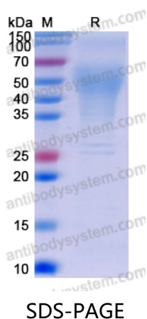
SDS PAGE for recombinant Human LYPD3 Protein