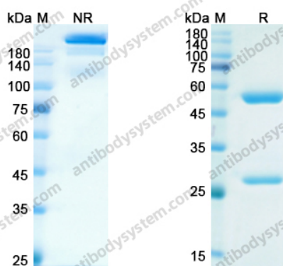
SDS PAGE for Eldelumab