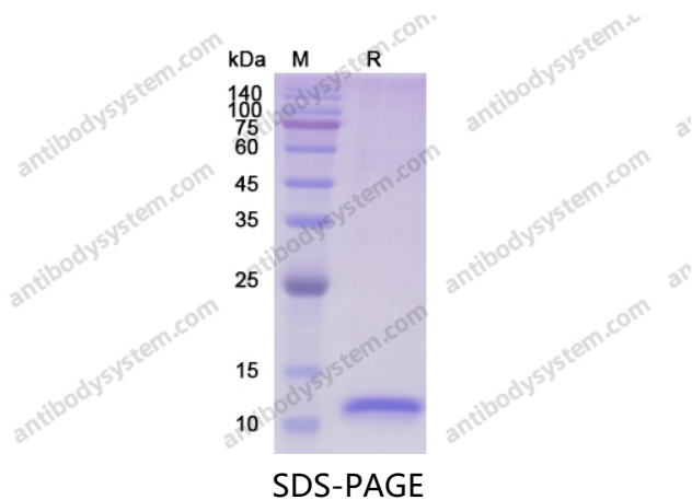
SDS PAGE for recombinant Human IL8 / CXCL8