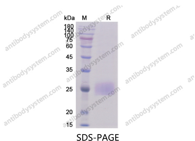
SDS PAGE for recombinant Human CD344 / FZD4