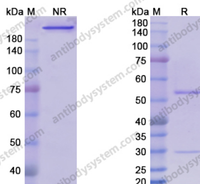
SDS PAGE for Setrusumab