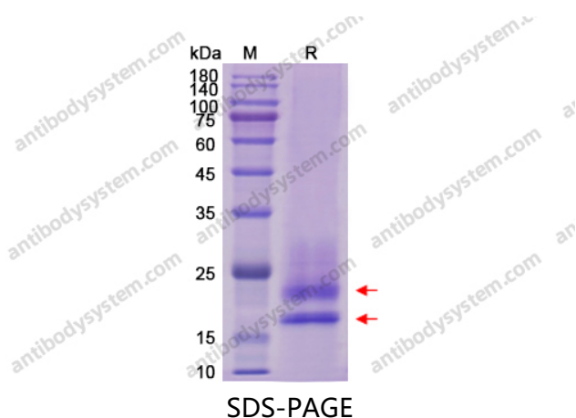
SDS PAGE for recombinant Human CD83