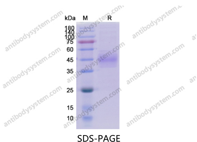
SDS PAGE for recombinant Human CD33