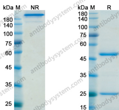
SDS PAGE for Dacetuzumab