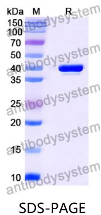
SDS PAGE for Human IgM Antibody (SAA0809)